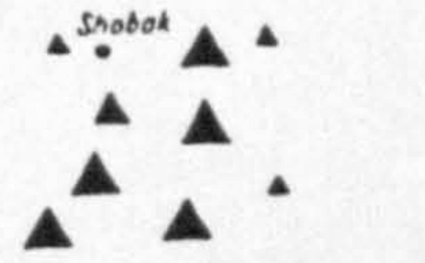
Fig. 1.8: Location of nomadic encampments and peasant communities at the end of the 19th century