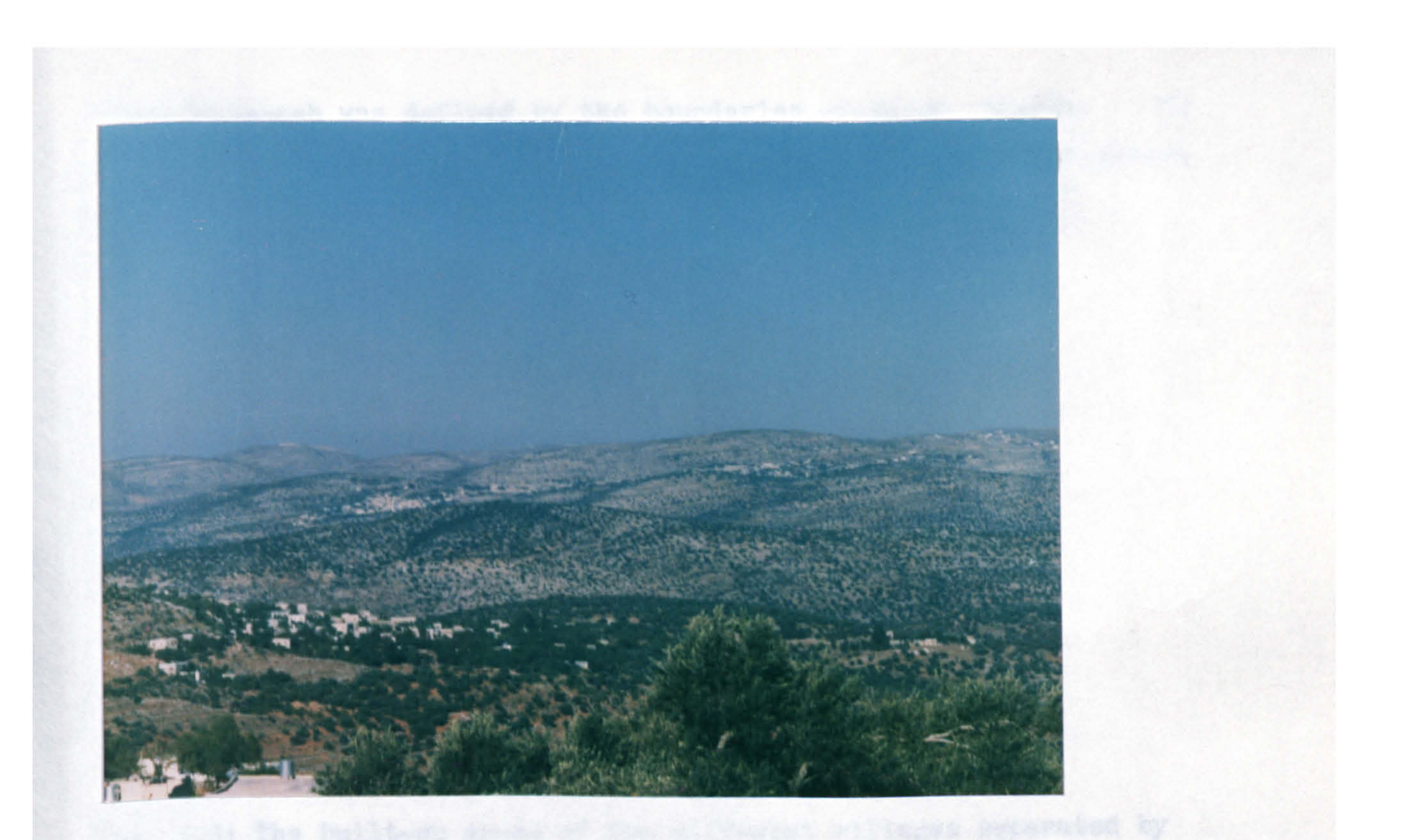
Fig. 3.1: Agricultural fields separate the villages' built-up areas.