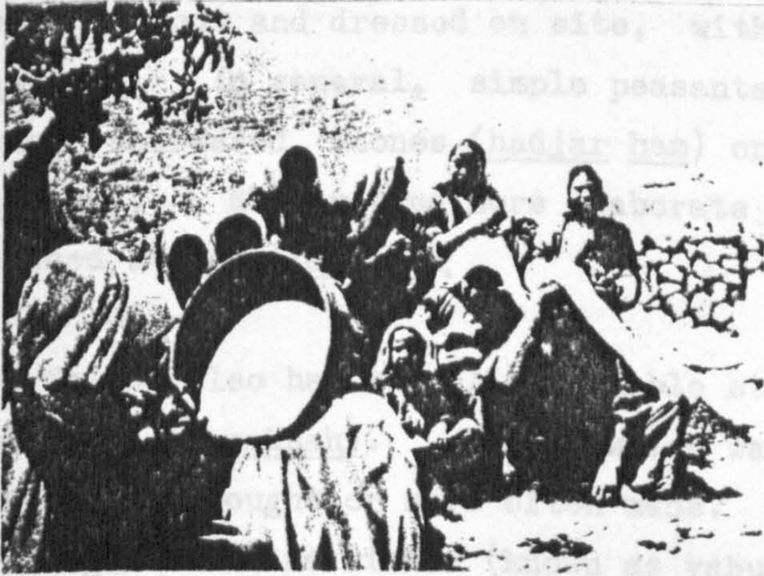
Bringing water to mix the building mortar