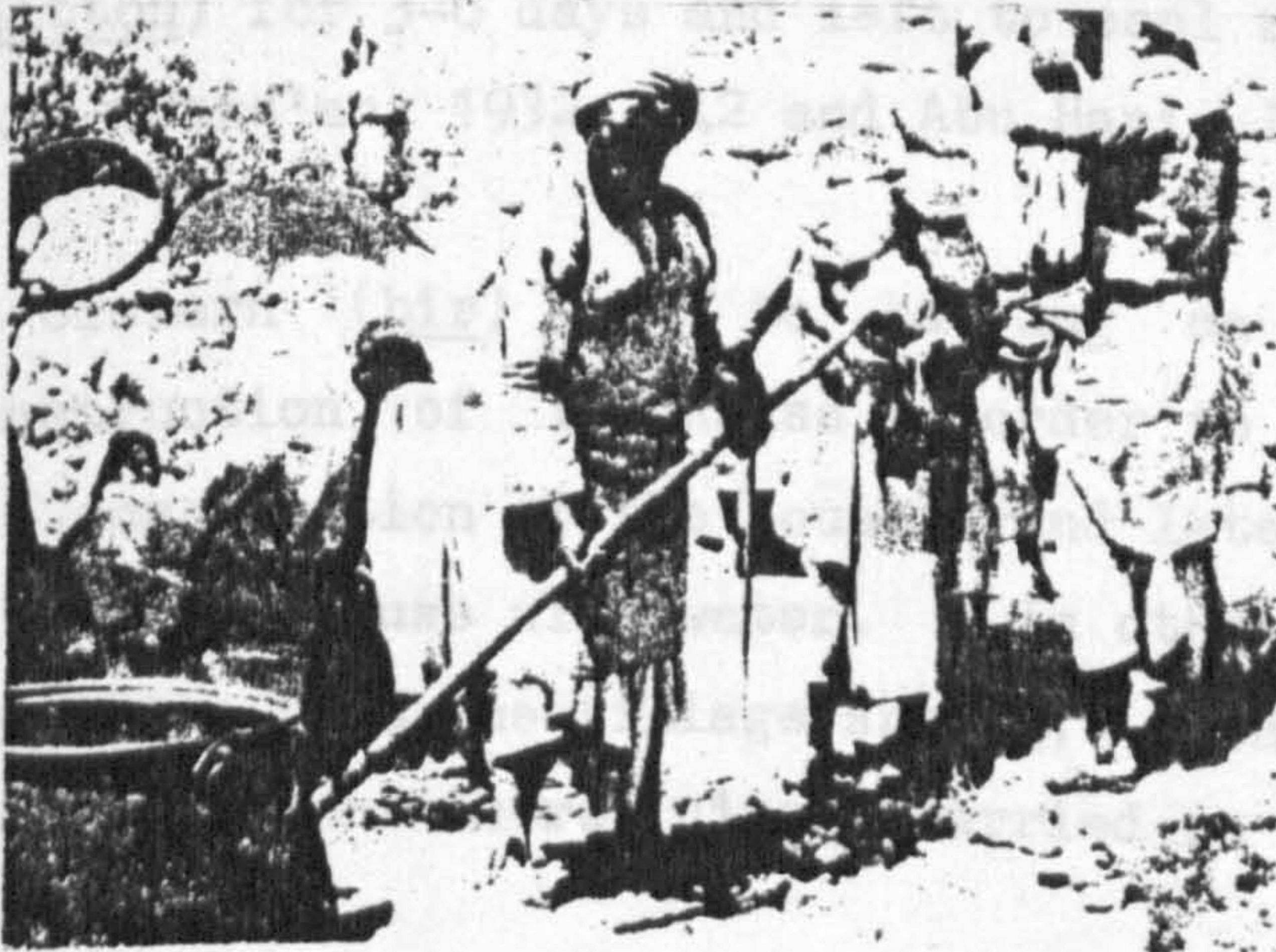
Heating pitch for sealing the roof