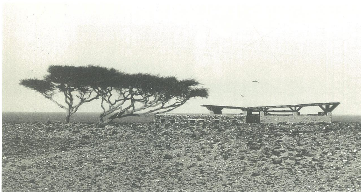
THE VISITOR CENTER OVERLOOKING THE RED SEA