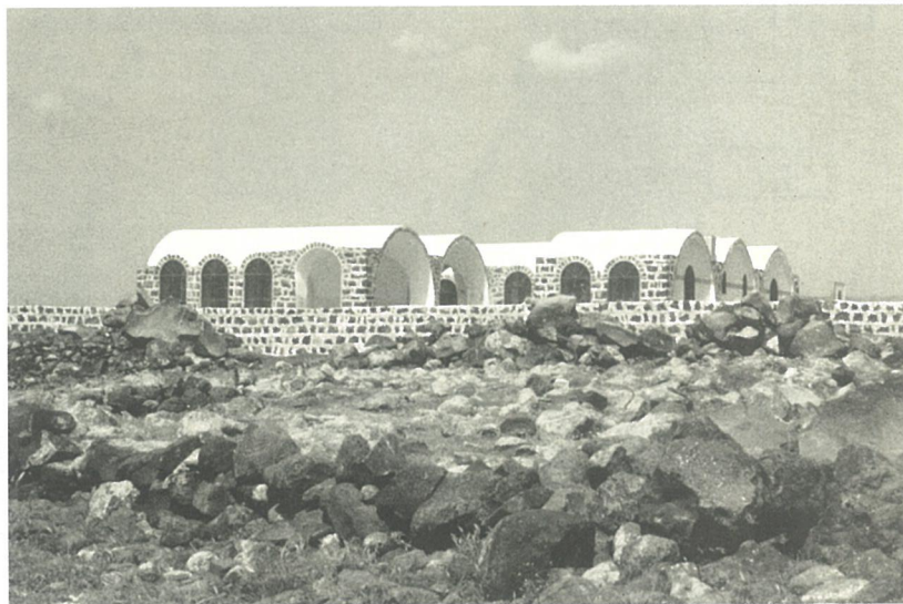
VIEW OF THE SCHOOL IN CONTEXT